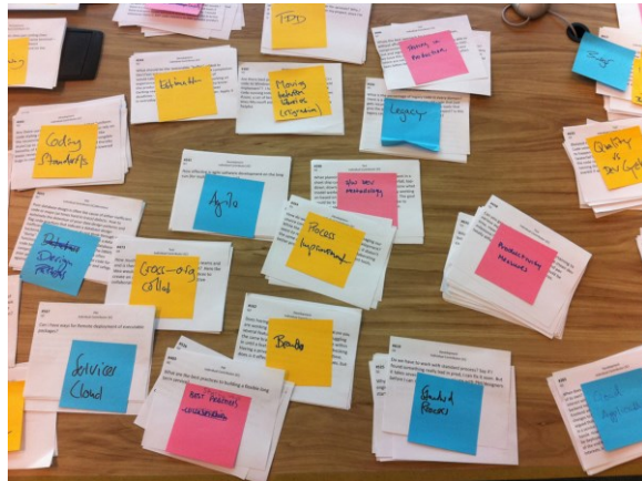
Figure 2. Photo of some of the subcategories that emerged during the open card sort.

also identified the need to seed the survey with data analytics questions. We supplied the following seed questions from the pilot responses, Greg Wilson’s list [9], and from our own experiences: